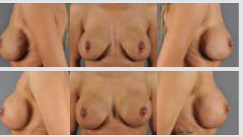
Figure 9. After use of SERI® Suraical Scaffold

Actual patient photos. Individual results may vary