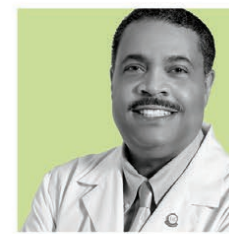
DERMATOLOGY Dr. Charles E. Crutchfield III EAGAN, MN DERMATOLOGIST @CrutchfieldDerm

"The pendulum is swinging back to procedures that deliver great results with one treatment session. Patients used to want to have no downtime, but now 10 to 14 days of healing time as the result of one full-field erbium resurfacing laser for the etched-in lines around the mouth and eyes is worth it to them."